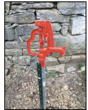
Left: Basils in half barrel at KSB. Right: New water hydrant at OCHG.