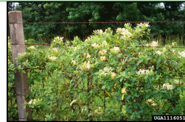
Japanese honeysuckle.

Sign up for email bulletins, programs, and other resources at the Indiana DNR https://www.in.gov/dnr/